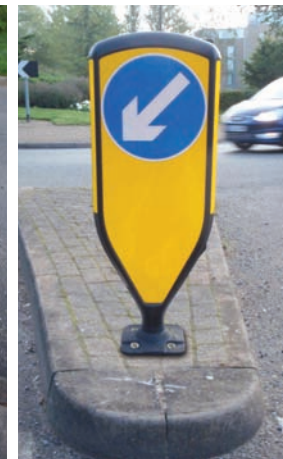
3Sixty has a slim but aesthetically designed appearance