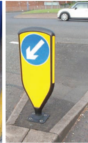
Conspicuity is guaranteed with 3Sixty.