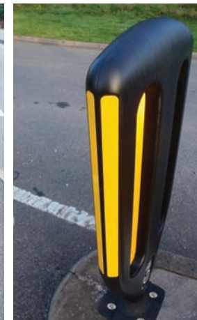
Reflective side panels are angled to assist vehicles turning into junctions