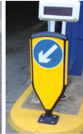
Although specifically designed for Pedestrian Islands the bollard is suitable for numerous sites where traffic control is necessary.