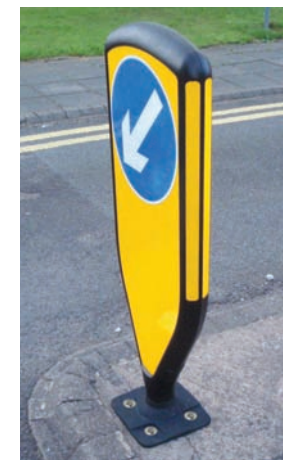
Value engineered for a highly competitive price without effecting quality or performance.