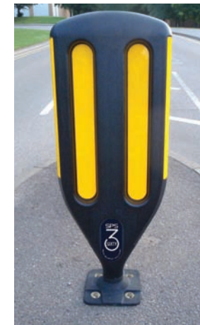
Rear reflective panels come as standard.