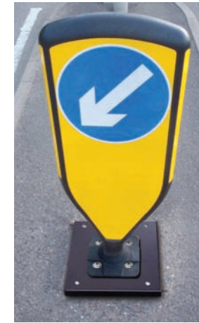
3Sixty can easily be adapted to fit redundant base lights